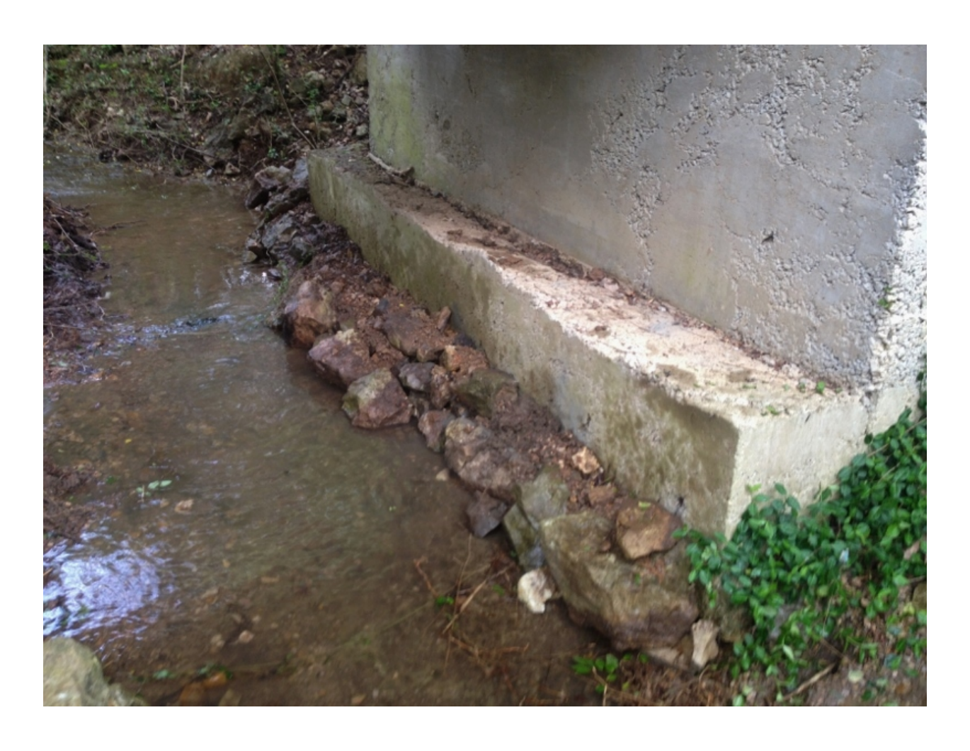
A look from the backside (downstream).