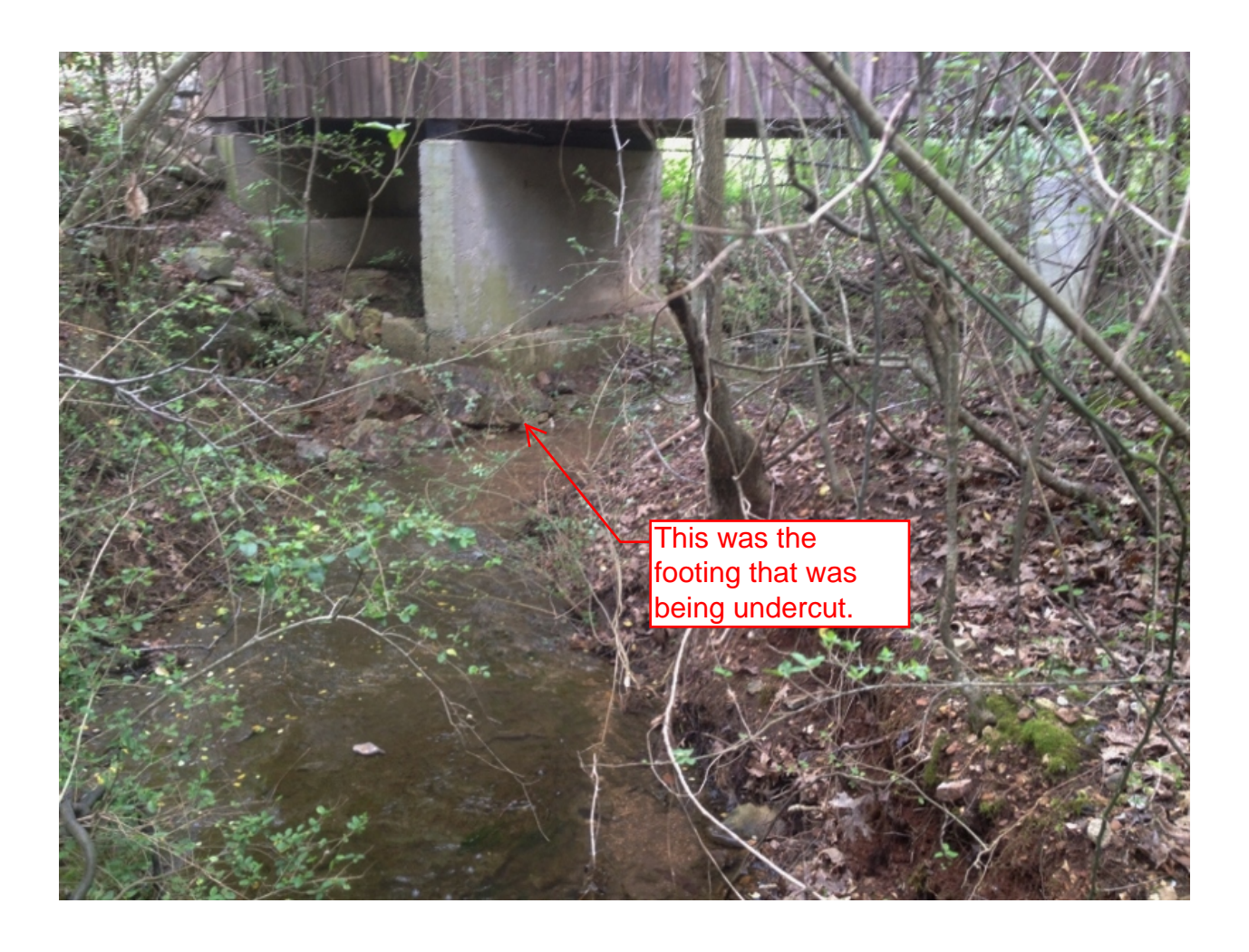
Ole 97 Bridge, a look from upstream, after work was complete. Removed a lot of the under brush to encourage erosion of the creek bank on the right side.